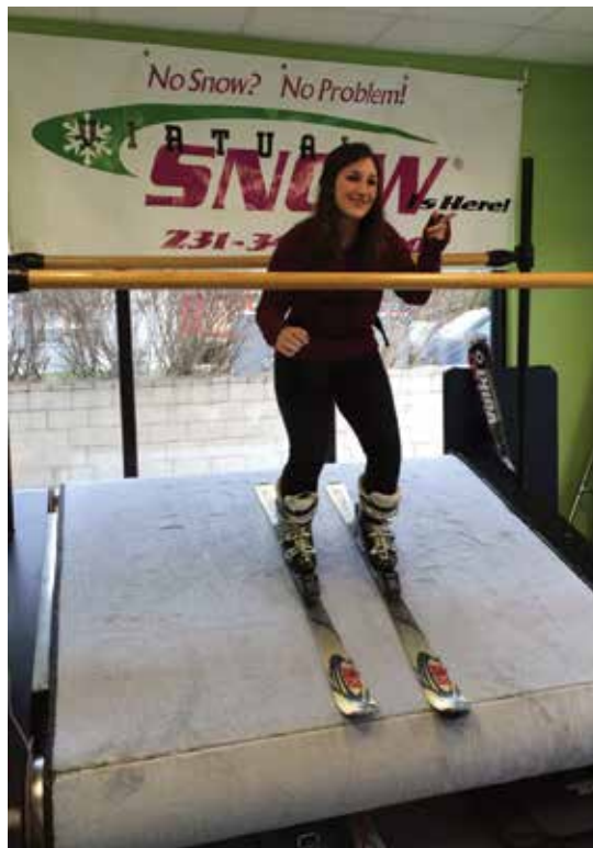
Sydney is so happy to be back on skis!!!!

Learning how to ski – Virtual snow is the safest way to learn how to ski or snowboard. You are in a controlled environment! With three safety features, you are unable to fall or get out of control. Plus no snow, no wind and no cold weather!