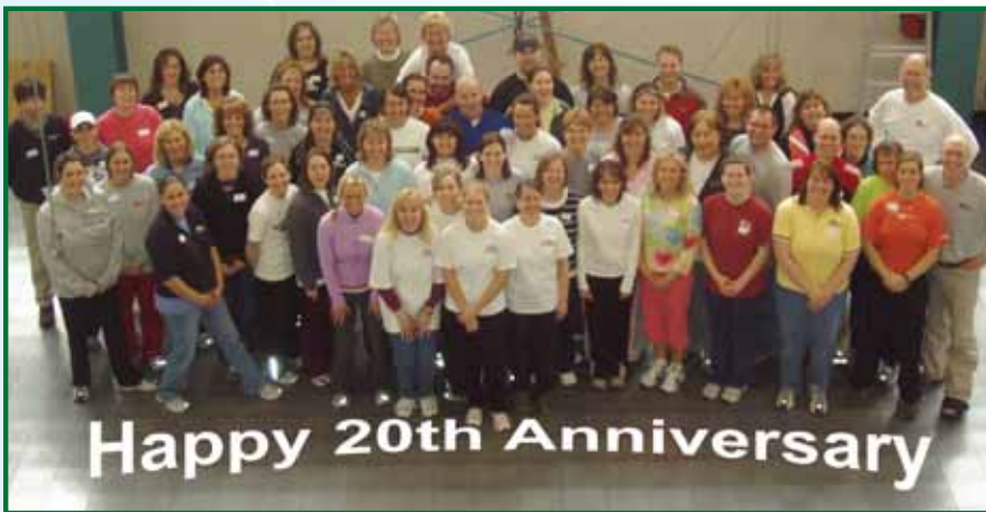
The staff of Northern Michigan Sports Medicine Centers

Northern Michigan Sports Medicine Centers offer physical therapy, occupational therapy, athletic trainer services, and wellness and fitness programs across the Tip of the Mitt with clinics in Cheboygan, Indian River, Rogers City, Petoskey, Harbor Springs and Charlevoix.